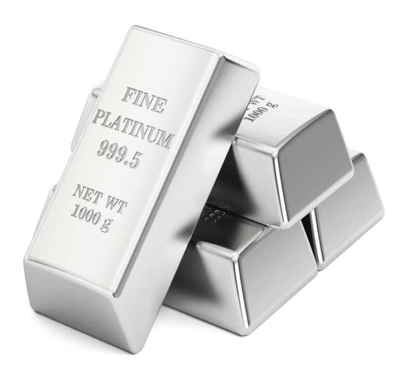
Platinum – 30% more efficient than the 2006 IECC

(Must obtain a score of 85 or below on the HERS scale.)