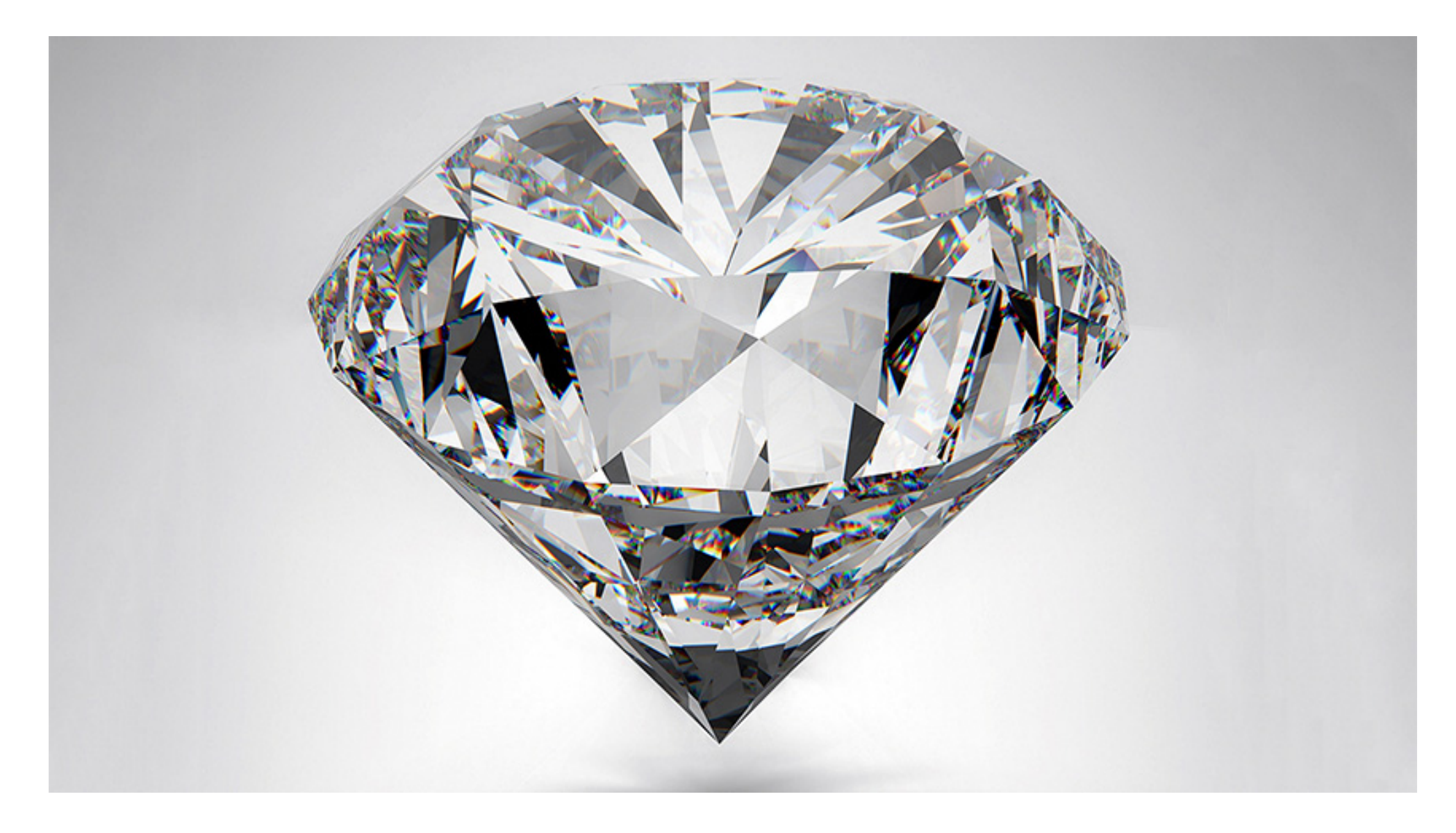
Diamond – 30% more efficient than the 2009 IECC (Must obtain a score of 65 or below on the HERS scale.)