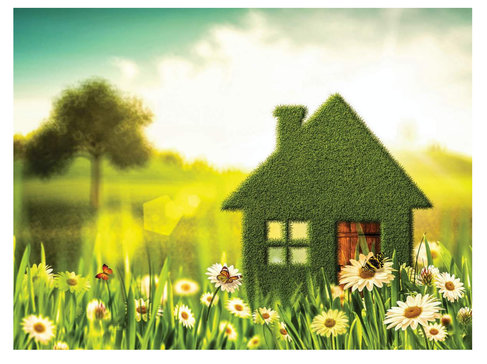
Certified Green – 20% more efficient than the 2009 IECC (Must obtain a score of 68 or below on the HERS scale.) 20% emissions and water usage reduction.