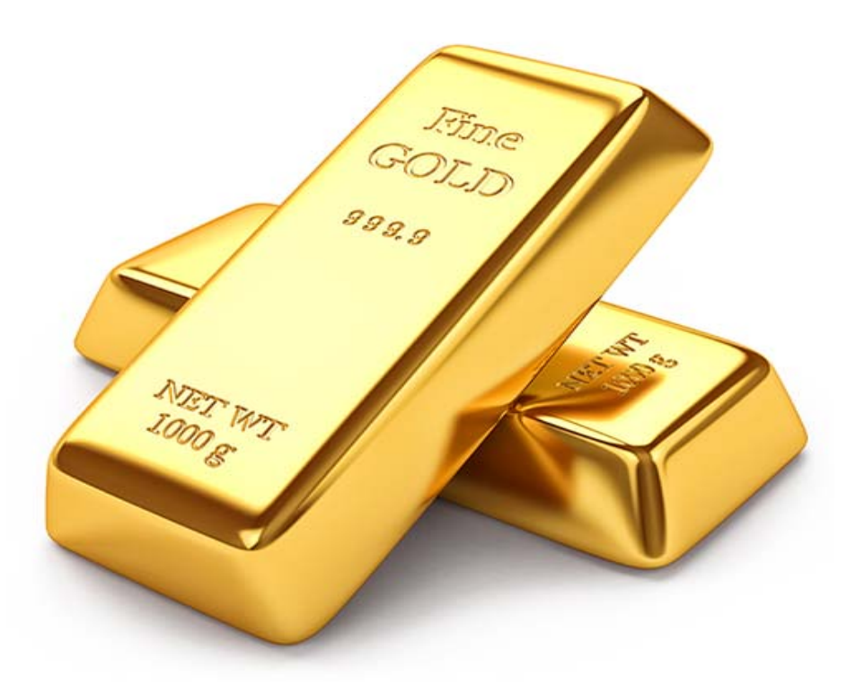
Gold – 15% more efficient than the 2006 IECC

(Must obtain a score of 85 or below on the HERS scale.)